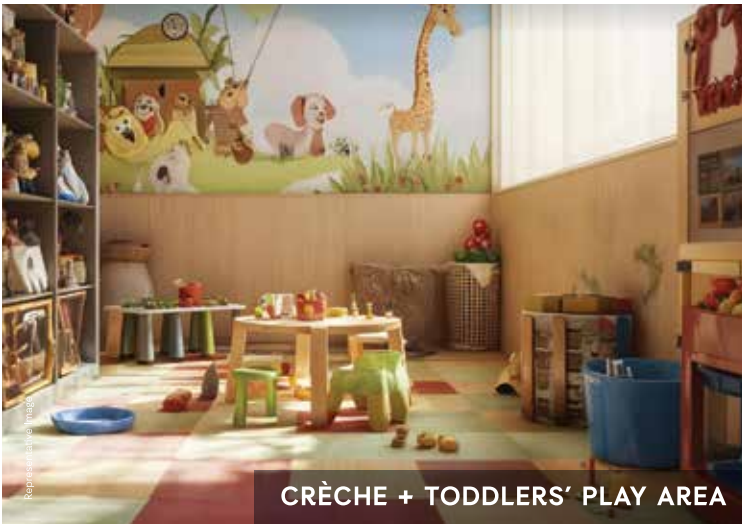
CRÈCHE + TODDLERS’ PLAY AREA